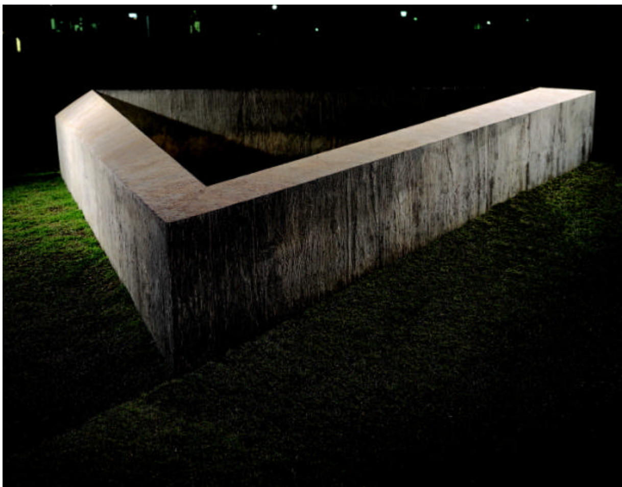
Donald Judd (1928 – 1994), Untitled , 1974-75, reinforced concrete, 126.0 x 760.0 x 660.0 cm (irreg.). Art Gallery of South Australia, Adelaide; South Australian Government Grant, in association with Marshall & Brougham Pty Ltd 1974.